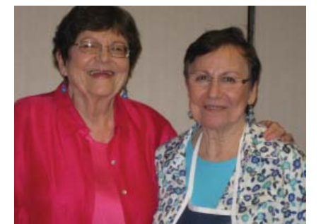
A VITAL advisor and Altrusa volunteer enjoying reception

NOTE: All rounds of the 2010 Quiz Bowl were filmed by CATS (Community Access Television Services) to be aired throughout the year on Comcast Cable Channel 3, The Library Channel. For dates and time, check the CATS schedule online at catstv.net , or call CATS at 349-3111.