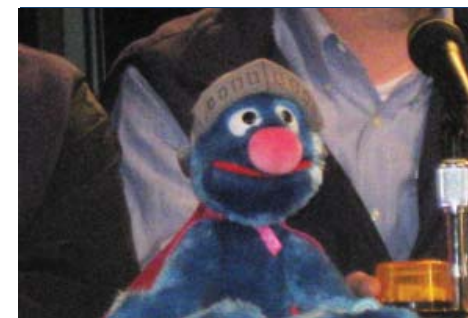
And what team but WTIU would have Grover as a mascot?