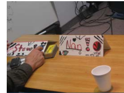
Artistic flair of the E-ville Edge-U-Cators on display