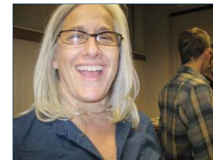
A very happy member of the Rotary Rounders