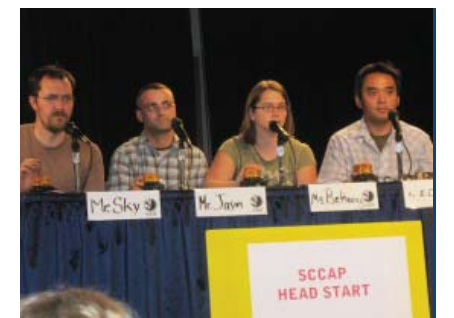
The very serious contenders of SCCAP Head Start