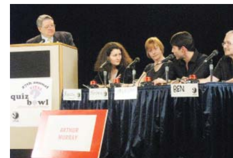
Arthur Murray, tango and trivia specialists