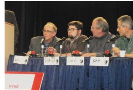
WFHB Community Radio, second-place winners