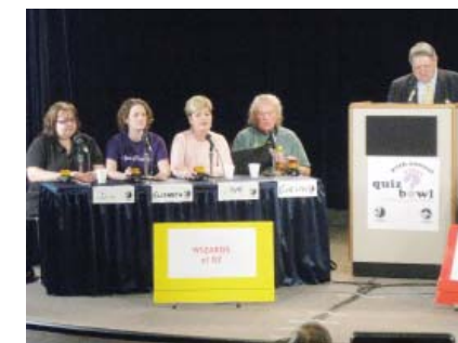
The Wizards of Oz, long-time Quiz Bowl players