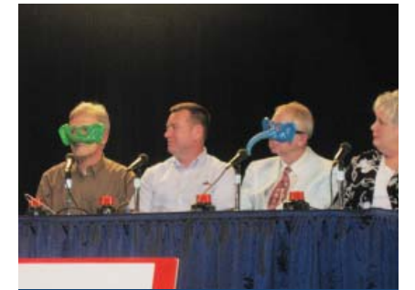
WorkOne hopes the elephant will help their trivia memory.